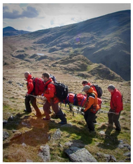
A callout in April 2011, on High Spy.

An additional major item of expenditure in 2012 was the purchase, at a cost of over £40K, of a second crew-bus/ambulance. The decision to acquire a fourth vehicle was based on many factors, including: the increase in number of occasions when the Team had concurrent rescues, and therefore the need to be able to transport Team members efficiently, including on off-road tracks, and to be able to transfer casualties.