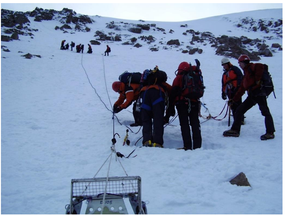
Training in Coire an-t-Sneachda, the Cairngorms

The year also marked 45 years since the first recorded incident, in 1961, on Sharp Edge on Blencathra. During that period there had been 50 incidents, with, tragically, eight fatalities.