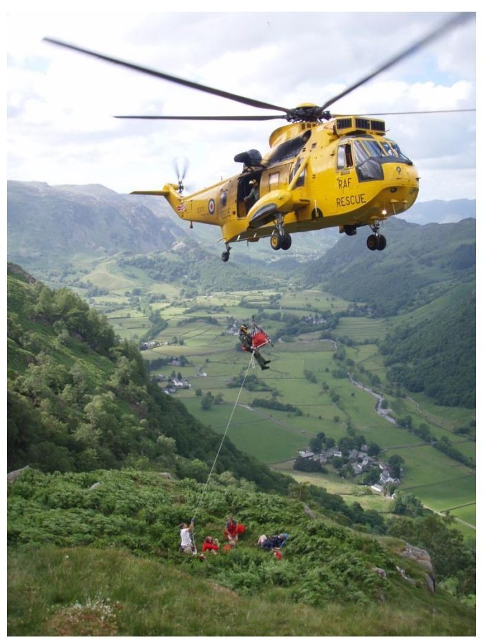
June 2010 – a callout at Hanging Haystack, Stonethwaite.

King helicopter, a Royal Navy helicopter, and three mountain rescue teams. Keswick MRT provided first aid treatment, and evacuation assistance, along with marshalling the helicopters at the scene.