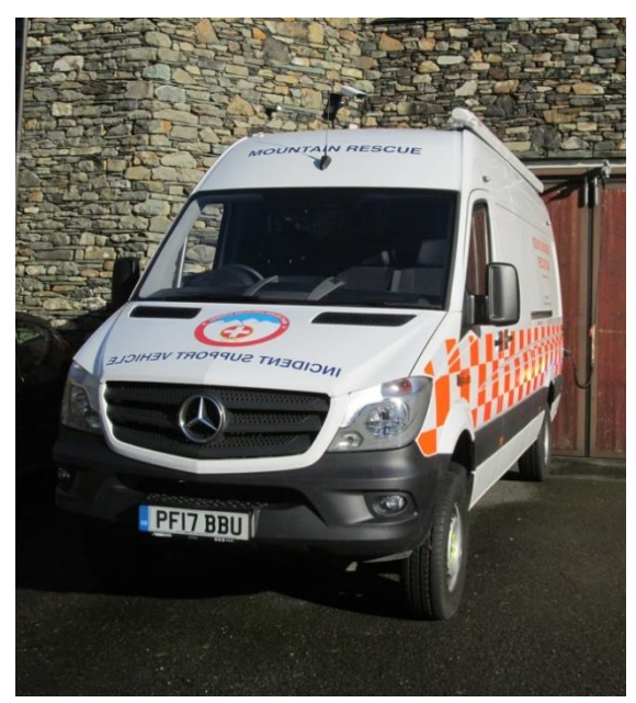
A long-wheelbase Mercedes Sprinter was acquired to be used as a dedicated boat rescue vehicle.

In January, the Team had the Introduction of further online systems to record Team members' training and development, and a gathering at the base of former Team members from the early years of the Team. The latter proved to be an occasion full of memories and anecdotes.