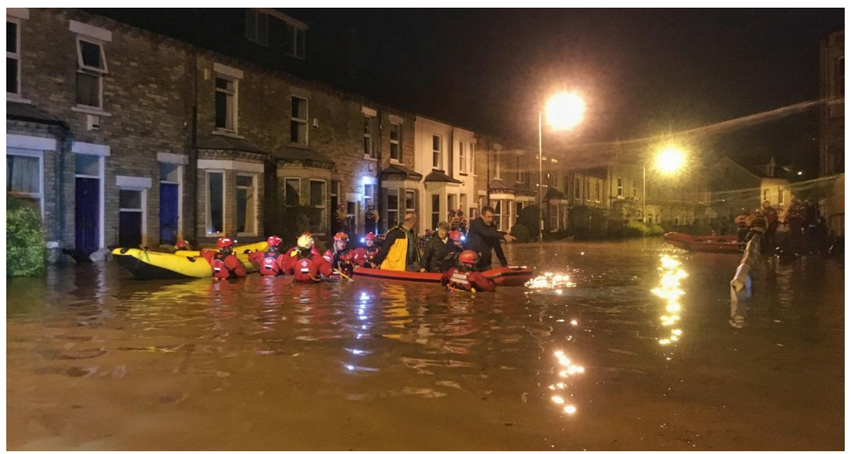
December 2015: Keswick and Cockermouth MRTs helping with evacuation of residents in York.

In early December 2015, the Team was again involved in a major multi-agency operation to deal with the effects of flooding in Keswick, caused by the advent of Storm Desmond. Later in the month, the Team helped in flood situations in Whalley, Lancashire and in York. Team operations in dangerous flood waters proved the value of having highly skilled Swift Water Technicians within the Team. It is unfortunate that Keswick MRT, along with many other rescue groups, has become well practiced at helping when Keswick suffers flooding, (incidents in 2005, 2009, and now 2015).